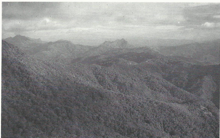
A. Overview of humid forest habitat at middle elevation on Mt. Aoupinié.