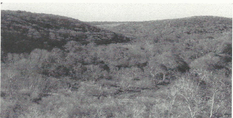
B. Sclerophyll forest habitat at Pindaï on the west central coast of New Caledonia.