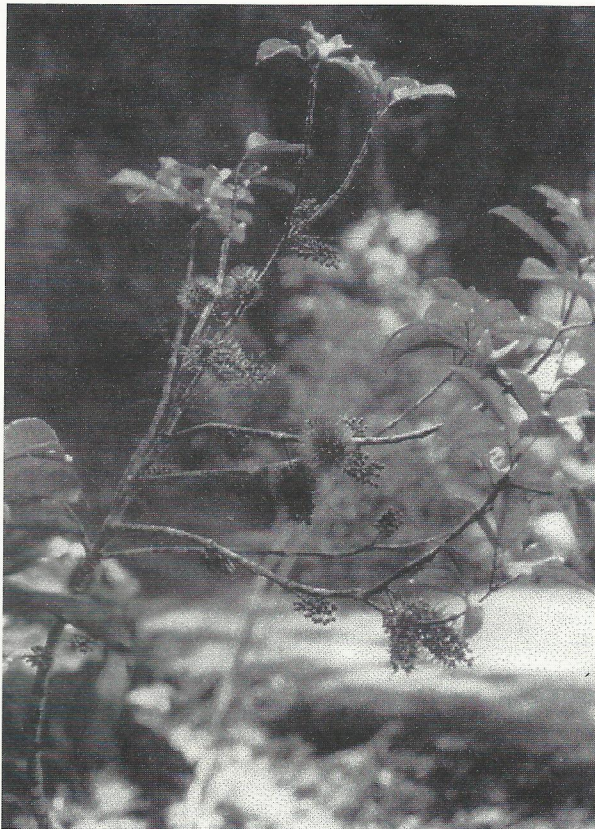
Plate 7. Geissois sp. from Mt. Do, southern New Caledonia. This plant is apparently utilized as a food source by Rhacodactylus auriculatus .

Bavay (1869) first reported on the diet of this species, indicating that it eats the flowers of Geissois (Cunoniaceae). This was verified by the recovery of anthers, stamens, and (possibly) pollen belonging to either a member of this family (or the Myrtaceae) from the stomach of one specimen (Bauer and Sadlier 1994b). On 9 January 1995 further evidence of the specific association between R. auriculatus and Geissois was obtained when geckos were found active on flowering specimens of Geissois spp. (Plate 7) 1.3-2.6 km from the summit of Mount (Mt.) Do (21°45' S, 166°00' E) in south central New Caledonia.